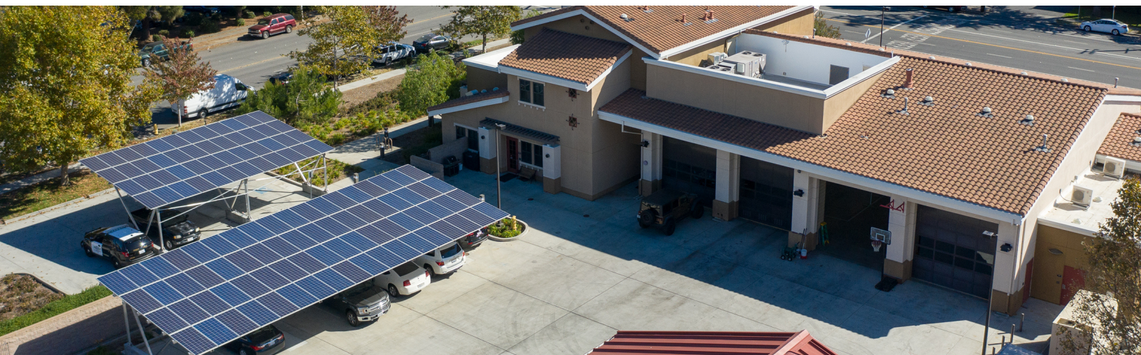
Photo above: Berkeley middle school students. Photo below: Fire Station #6, Fremont, California.