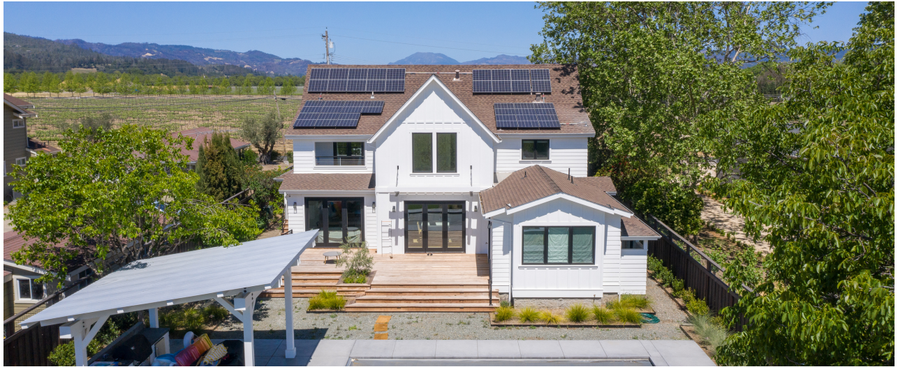
Home Solar / Napa, CA