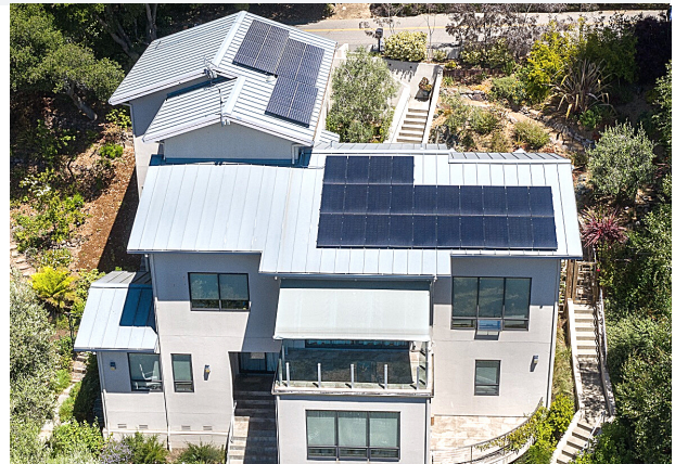
Home Solar | Oakland, CA