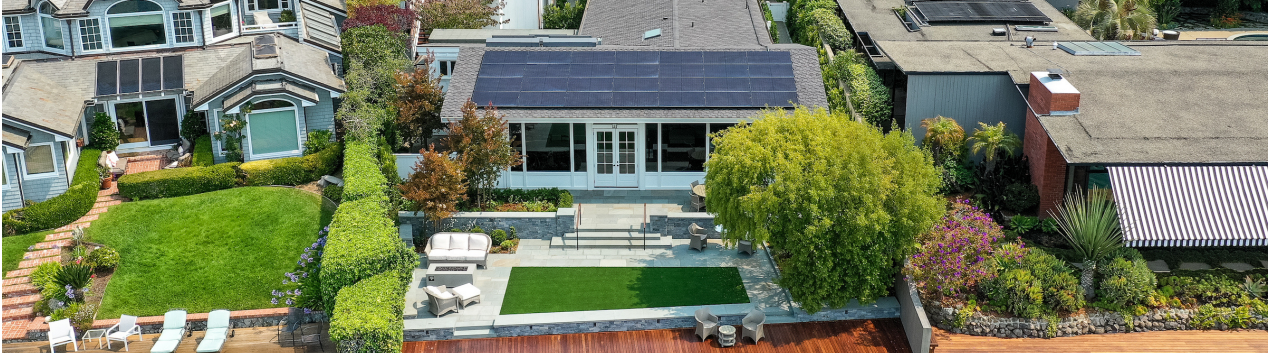
Home Solar | Belvedere, CA

Sun Light & Power is a 100% employee-owned B Corp that puts people and the planet first. We have been in business since 1976 and are passionate about the widespread adoption of residential solar energy.